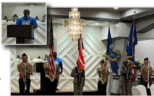
Ellet High School Jr. ROTC Presenting the Colors to Stand Down Opening